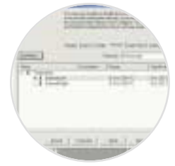
Step by step configuration process