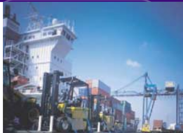
ESCORT iLog Temperature Loggers